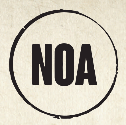
EAT | DRINK | SHARE

NOA is set in the heart of Edge Hill Village. Cornering on Collins Avenue and Pyne Street, the venue offers an array of function opportunities; from quaint gatherings to large celebrations.