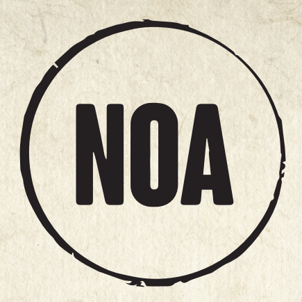
EAT | DRINK | SHARE

NOA is set in the heart of Edge Hill Village. Cornering on Collins Avenue and Pyne Street, the venue offers an array of function opportunities; from quaint gatherings to large celebrations.